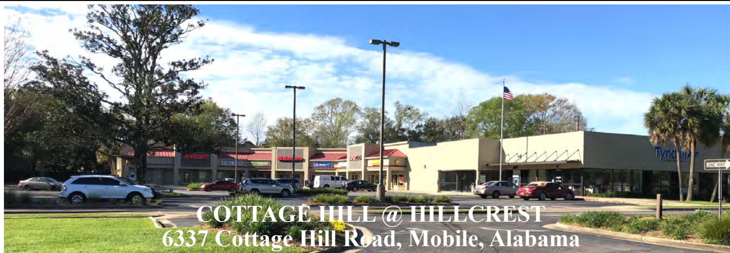
COTTAGE HILL @ HILLCREST 6337 Cottage Hill Road, Mobile, Alabama

Located on Cottage Hill Road near the intersection of Hillcrest Road with direct access to both streets.